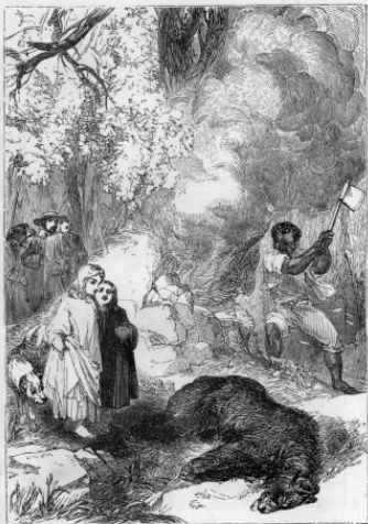
The Bear in the Honey-tree.—P. 380.

of smoke came oozing out of the bee-hole, and the terrified bees swarmed out in clusters. We had not thought of this before, else we might have saved ourselves the trouble of making the gloves and masks.