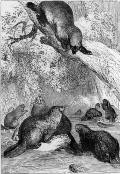
The Wolverine and the Beavers.—P. 185.

"I was curious to see whether the beavers would now return to the breastwork, and I resolved to remain a while longer without showing myself. I waited about five minutes or more, at the end of which time I saw several of them—who had gone to