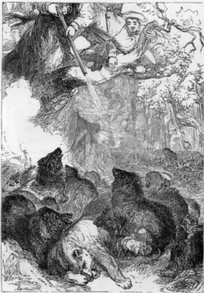
The Enraged Peccariee.—P. 428.

quickly enough to a tree, might fall victims to these fierce creatures. I determined, therefore, at length to try what effect a shot or two might have upon the herd.