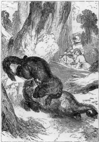
The Marten and the Porcupine.—P. 328.

right side up again; and in a few moments the struggle would have ended, by the porcupine's throat being cut; but we saw that it was time for us to interfere; and, slipping Castor and Pollux from the leash, we ran forward.