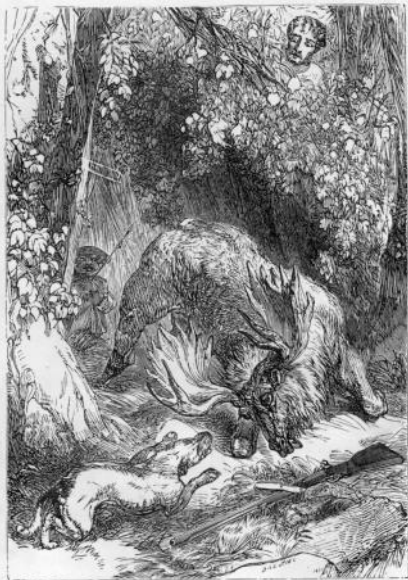
The Wounded Elk at Day.—P. 145.

The mastiff still continued his attack, but was evidently cowed by the fate of his companion, and only snapped at the elk when he could get round to his flanks. The other dog lay among the weeds howling piteously.